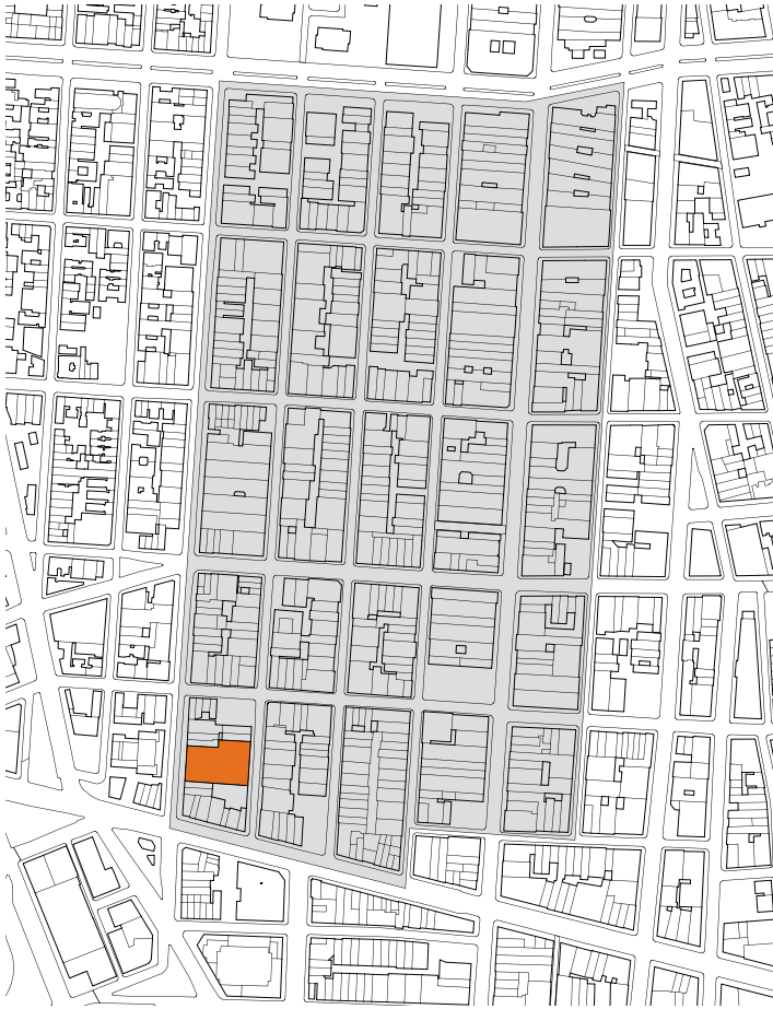
Soho Cast Iron Historic District site plan