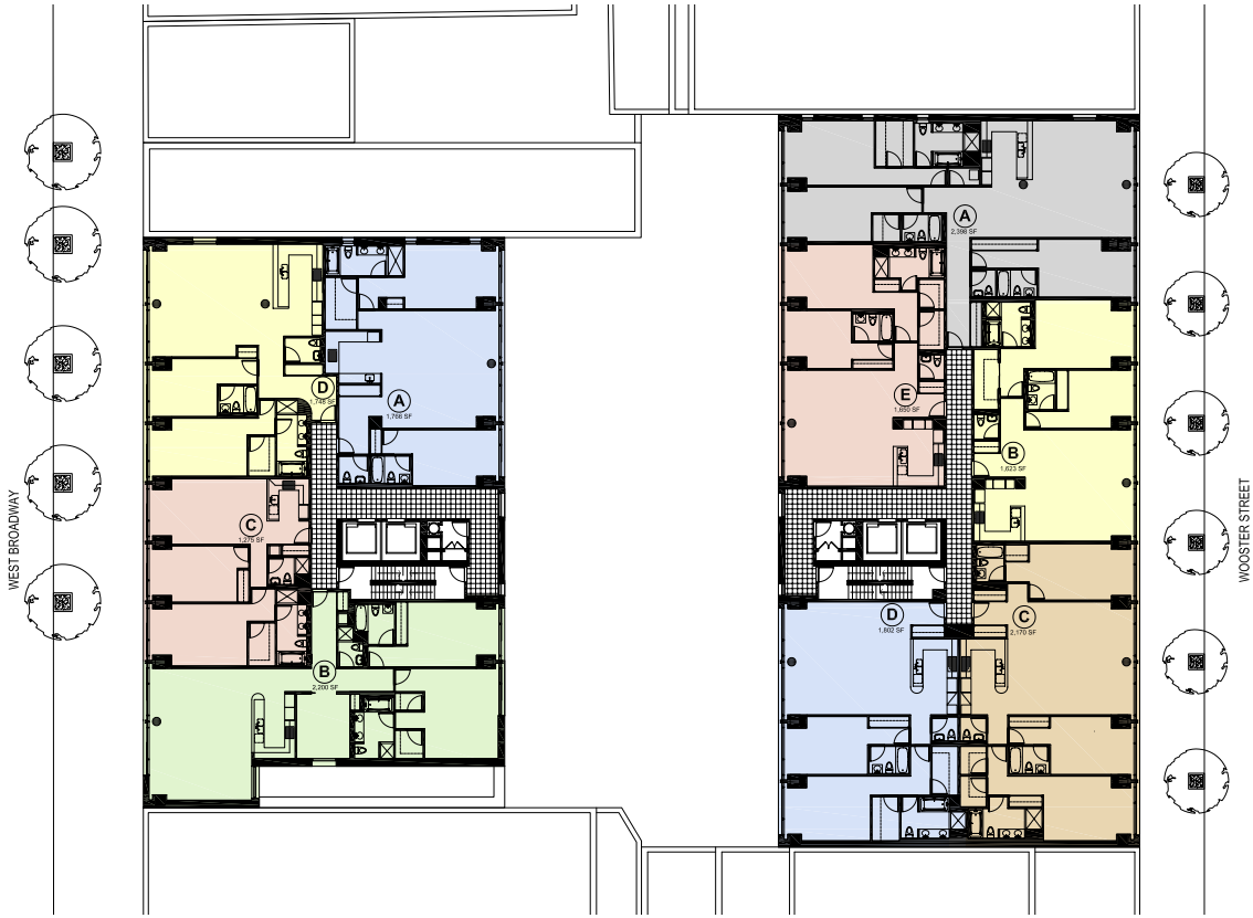
Typical floor plan