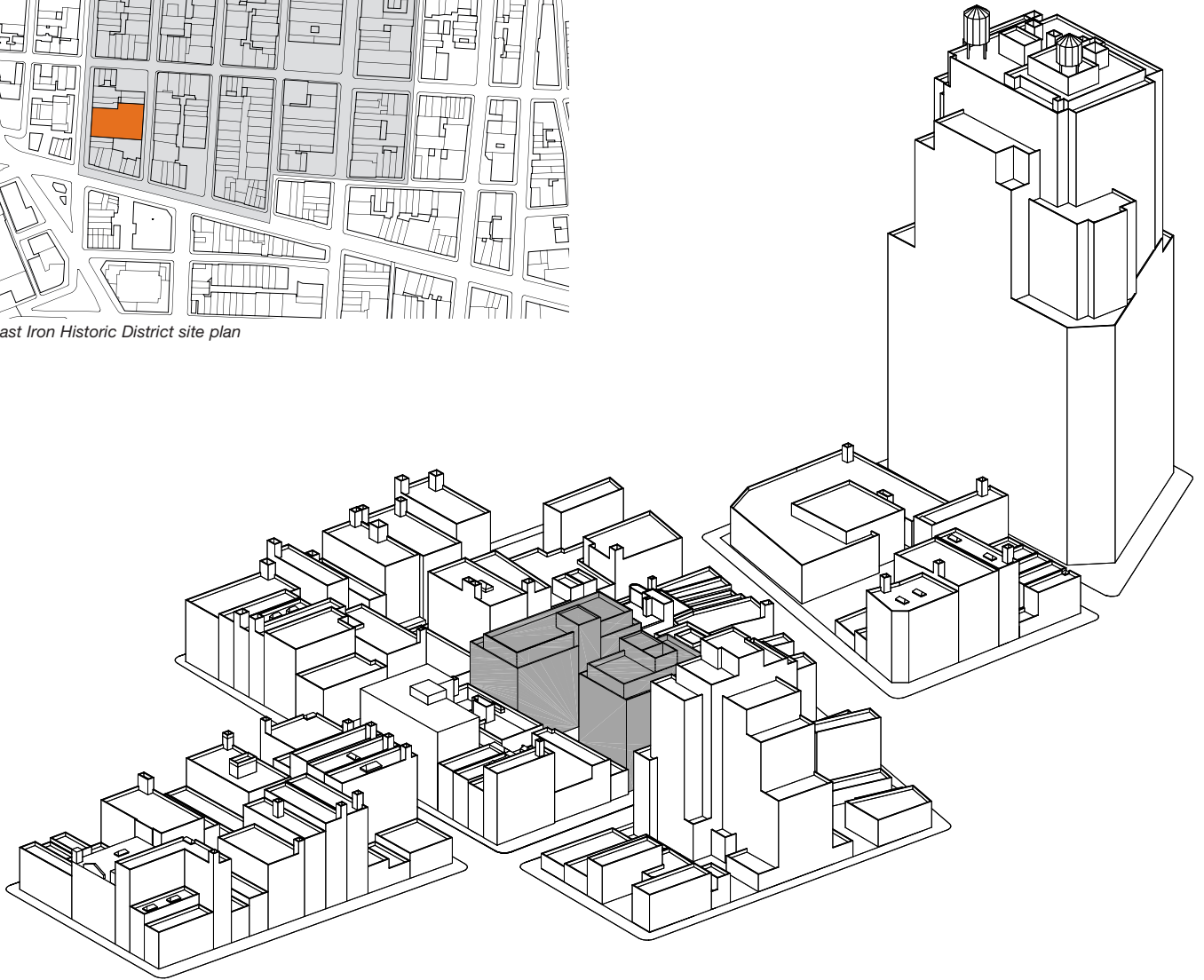
Site context axonometric